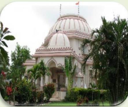
Tadkeshwar Mahadev (4 km)