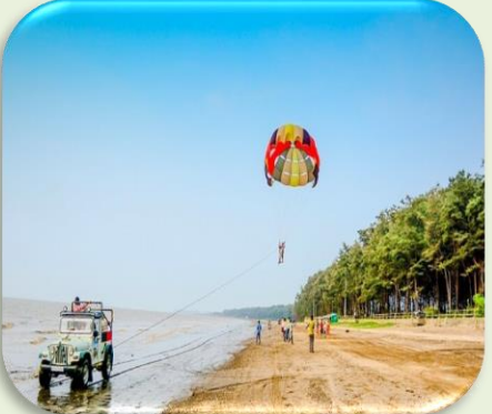
Devka Beach-Daman (25 km)