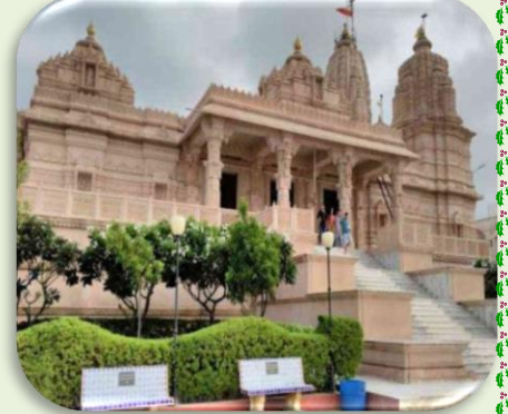
Swaminarayan Temple (5 km)