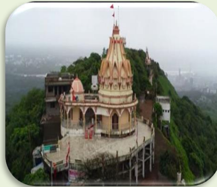
Parnera Hills (9 km)