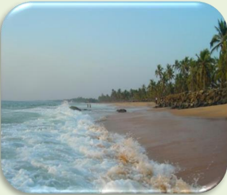
Tithal Beach (5 km)