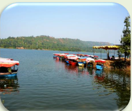
Dudhani lake-Silvassa (96 km)