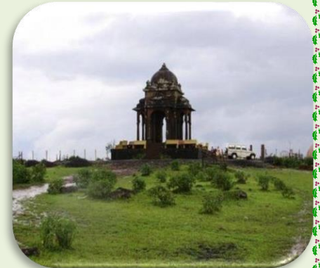
Wilson Hills (51 km)