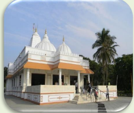
Saibaba Temple (5 km)