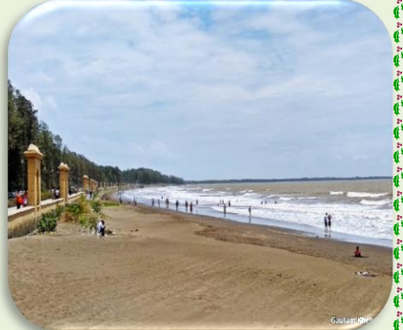
Jampore Beach-Daman (31 km)