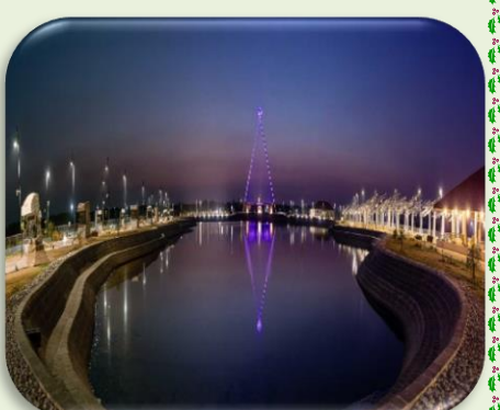
Salt Satyagrah Memorial Dandi (55km)